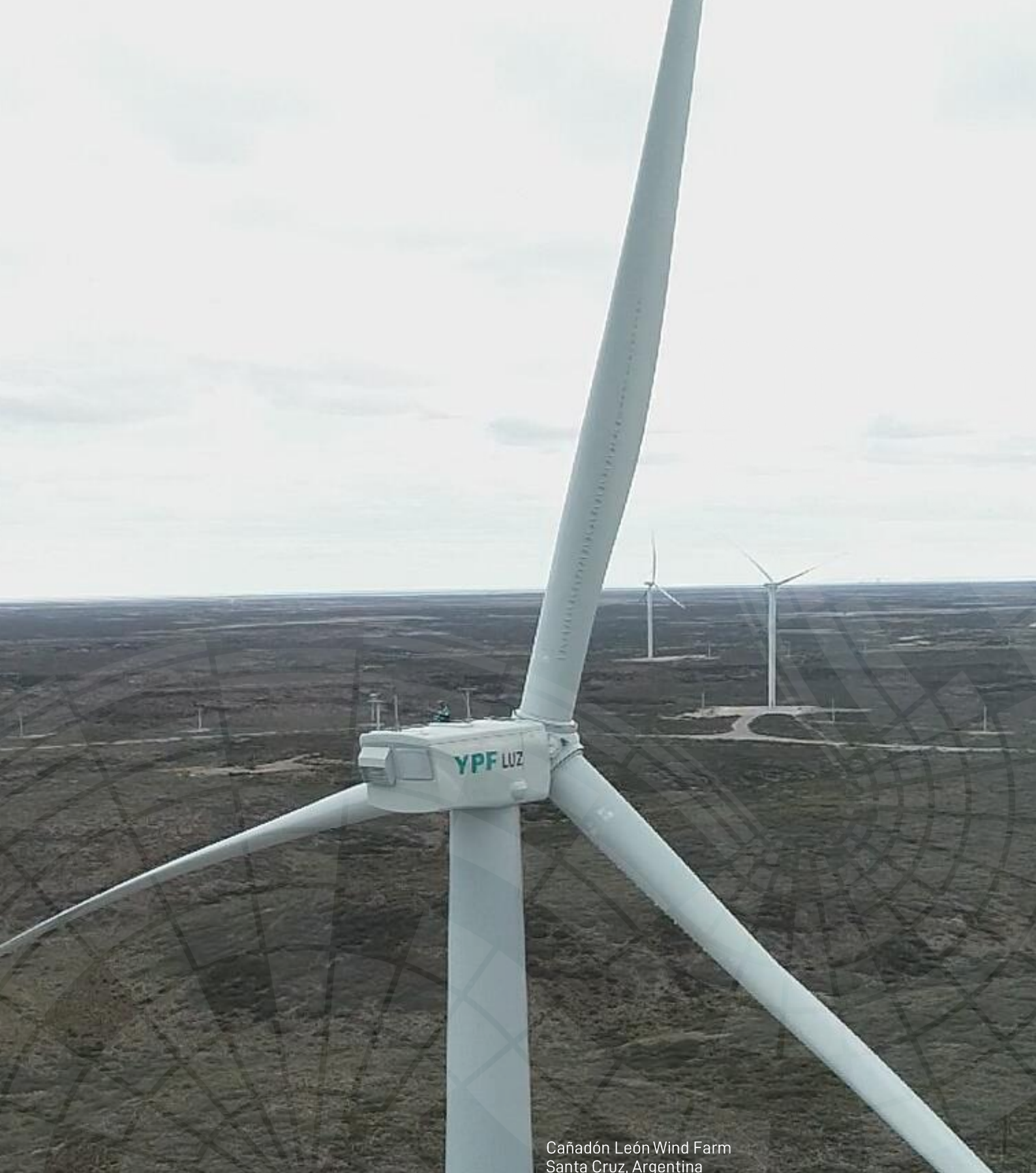
Cañadón León Wind Farm Santa Cruz, Argentina